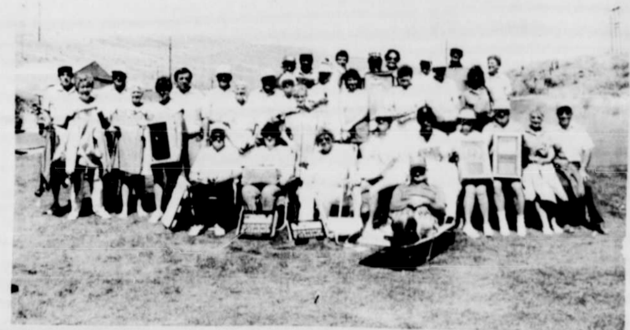
Winners show off their prizes following the conclusion of the Willow Creek Country Club's Couples Tournament held over the weekend in Heppner.

Wilkens was taking part in the shotgun start, where groups of four couples each started at different holes.