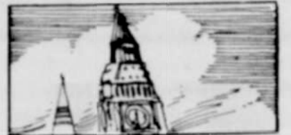
Big Ben is the 13 1/2 ton bell in the clock tower of the Houses of Parliament in London—the name is often incorrectly applied to the clock itself.

A survey to be used in the application is now underway in the county to determine the need for the new bus. Volunteers are also determining the medical needs and preferences of residents. In addition they will be telling people of the many medical services now available to county residents, Carlson said.