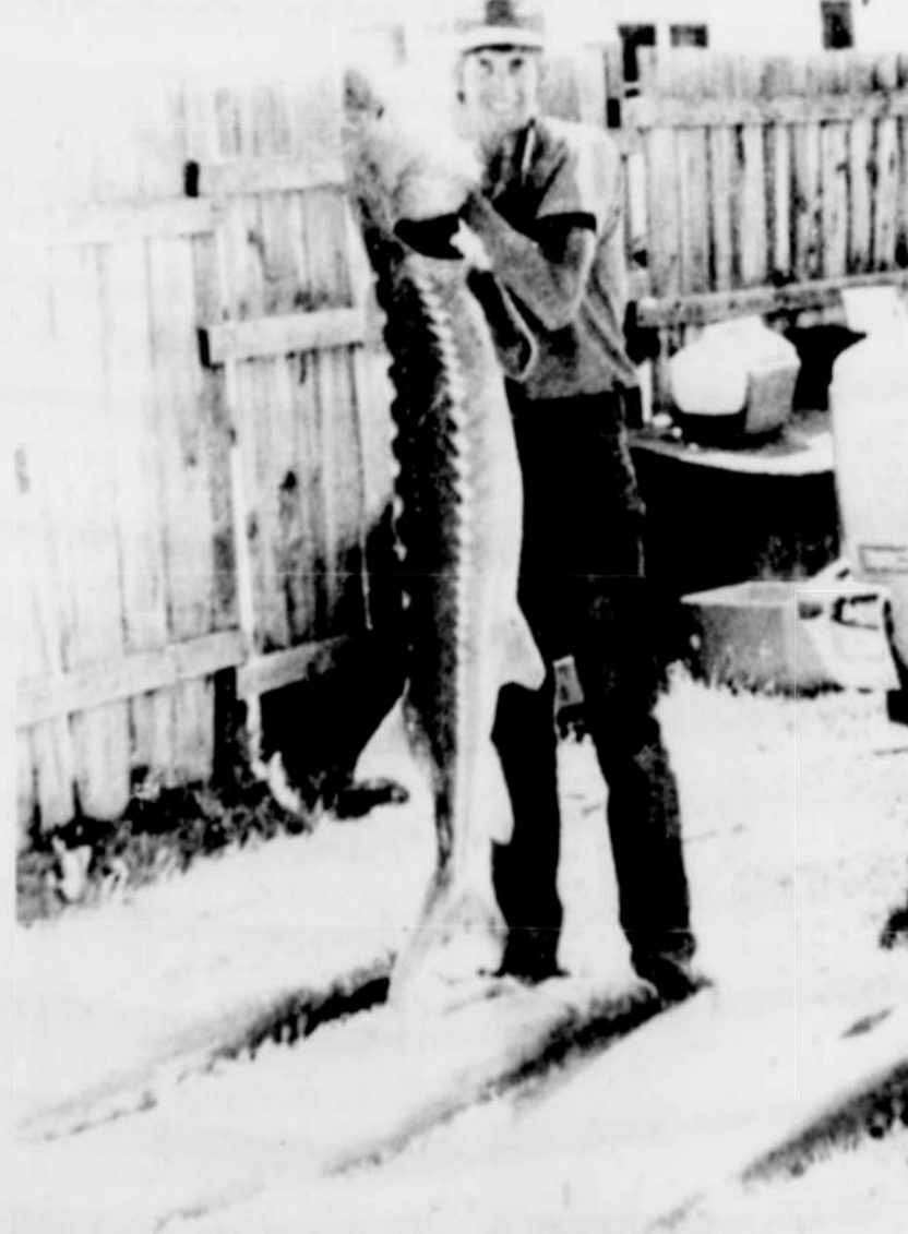
Whale of a Sturgeon!