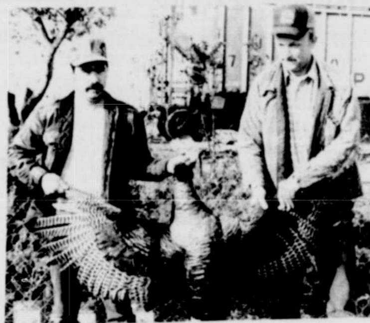
Local man bags turkey

That's how little time it takes to get a tropical-looking tan at CHERI'S HAIR & NAILS 676-9603