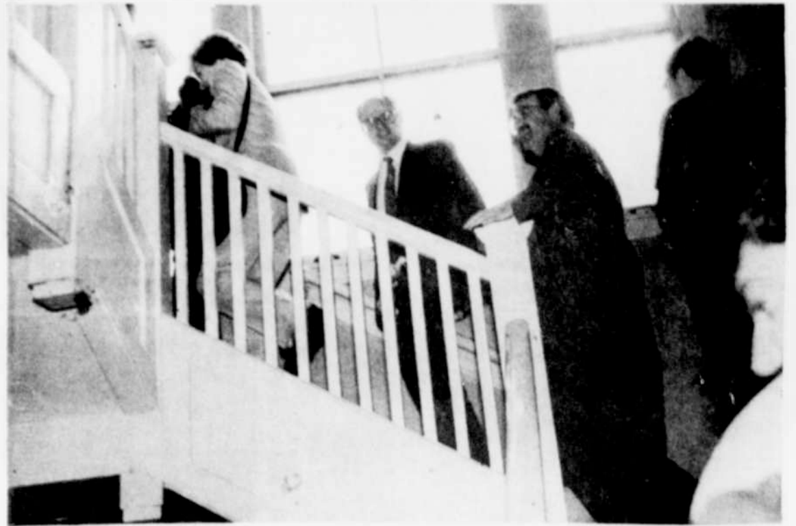
Chamber members head up stairs of old Heppner Hotel