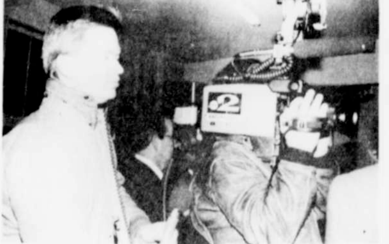
The media came to town

The City of Heppner received a very special gift on the occasion of its 100th anniversary of incorporation February 9, 1887-the presence of Oregon's Governor Neil Goldschmidt. The Governor first stopped at Heppner Elementary School where he spoke with students, shook hands and led them in singing Happy Birthday to Heppner. At Heppner City Hall Goldschmidt was greeted by local politicians and citizens, and a crowd of news media-newspapers from Hermiston and Pendleton, a radio station from Hermiston, and television cameras from Tri-Cities in Washington and from Portland.