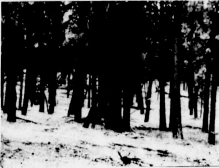
Section of forest that has not been thinned.