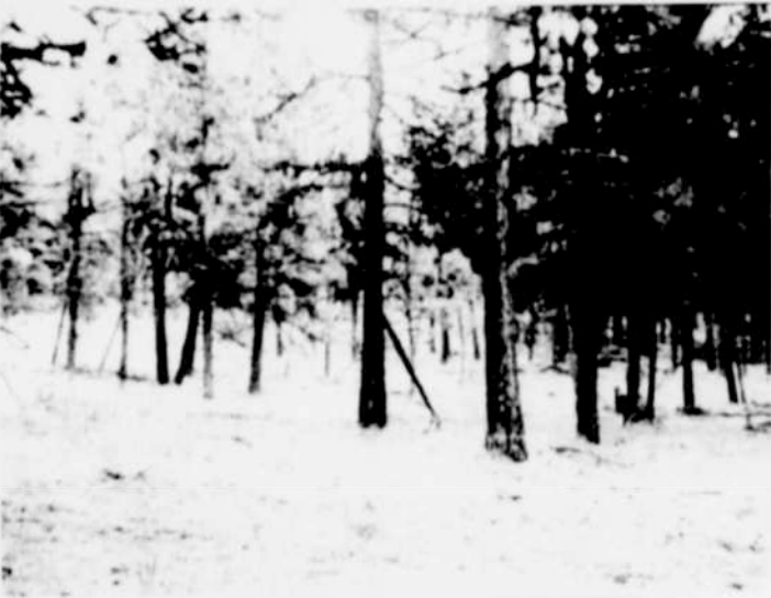
Trees that have been thinned. Grass has been reseeded begins to provide ground cover.