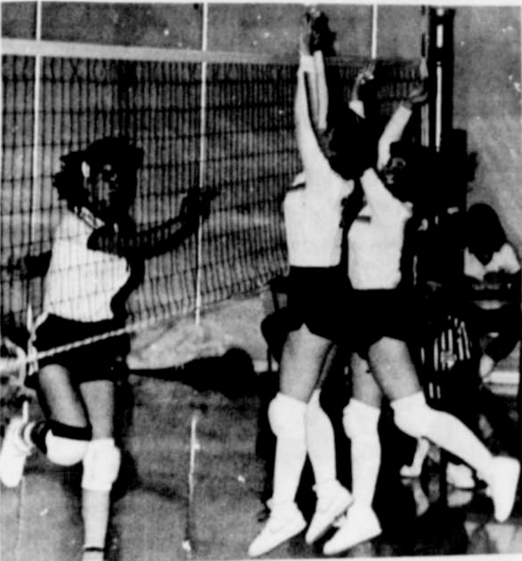
lone in action against Grizzlies.