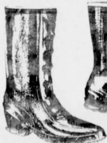
14" Western Lace

For Farming, Industrial, Sporting or Just Plain Warm Feet, We have LaCrosse Weatherproof Footwear for You.