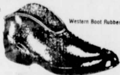
Western Boot Rubber