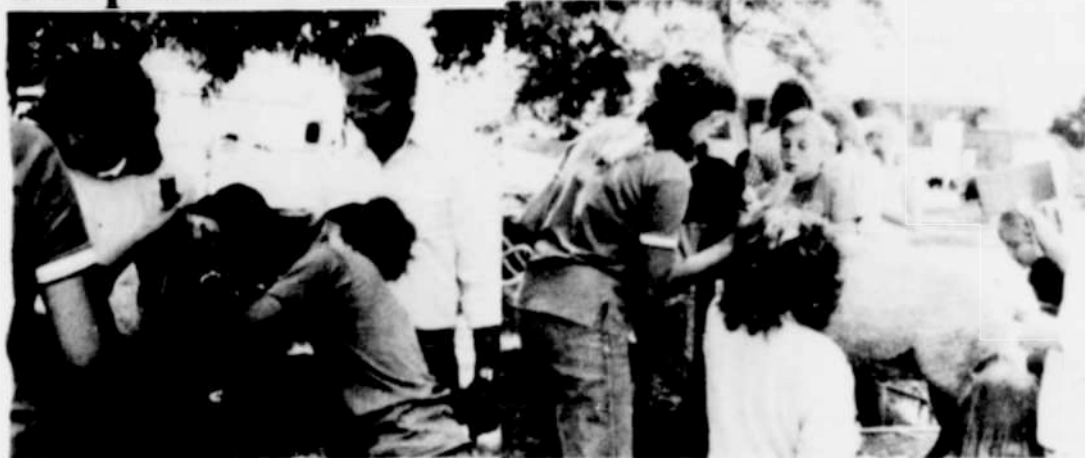
4-H'ers learn to judge, fit, and show their sheep.

Judging animals as well as hands-on experience in fitting and showing sheep under the expert eye of an experienced judge prepared over 50 4-H'ers, parents, and leaders for events at county fair.