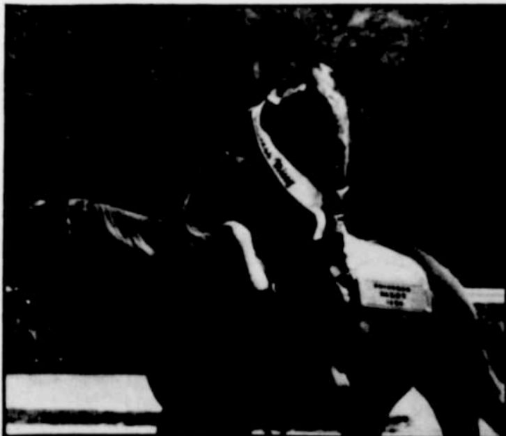
Princess Missy Schoonover

The court also has purchased a Burgundy pair of jeans, pink plaid blouse and a cool tee-shirt to complete their work outfits. The court is looking forward to fair and rodeo and will be wearing all of their outfits at the different activities.