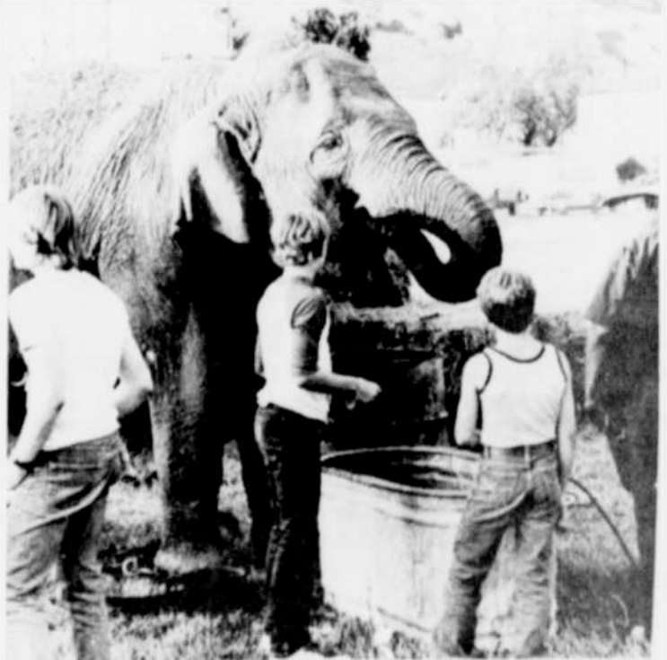
Circus goers get a close look at one of the elephants.

The first Morrow County project calls for replacing the Willow Creek (Huber) Bridge on Meadowbrook Farm Road, one mile southeast of Lexington. The work is estimated to cost between $100,000 and $250,000 and is expected to be completed by October 31, said the