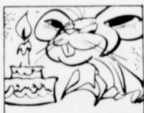
The expected lifespan for a mouse is about five years.

A mulching material, such as pine bark, spread three inches thick over the surface of the plant's bed will conserve moisture and reduce water requirements. Mulching will also maintain a uniform moisture level and minimize plant stress caused by wet-dry fluctuations in soil water.