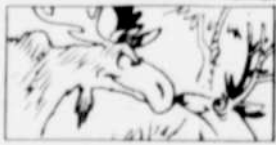
The largest member of the deer family is the moose. It's larger than any deer that lived in the past, too.