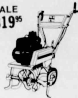
Model 310 (485 677)