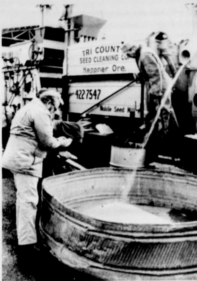
Farmers view demonstration of wheat cleaning

About 40 producers attended the meeting. Anyone interested in more information concerning the subjects discussed is encouraged to call the County Extension Office, 676-9642.