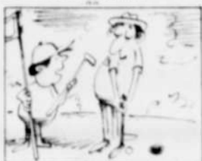
There are more than ten thousand golf courses in the United States.