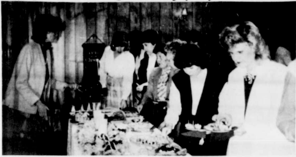
Heppner Soroptimists and guests select goodies from a large assortment of hors d'oeuvres at the November 23 Soroptimist style show. Models wore