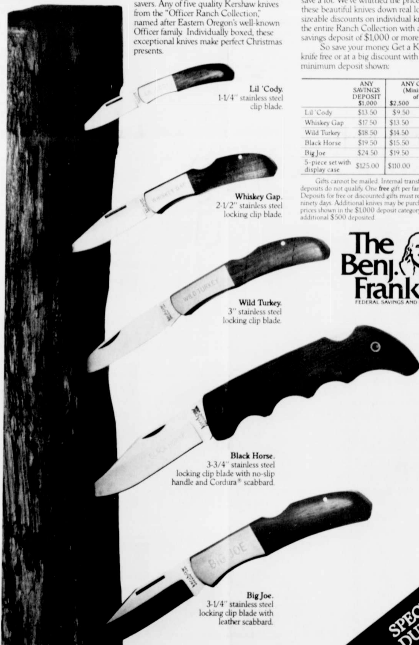
Lil 'Cody. 1-1/4" stainless steel clip blade.

Gifts cannot be mailed. Internal transfers of deposits do not qualify. One free gift per family. Deposits for free or discounted gifts must remain ninety days. Additional knives may be purchased at prices shown in the $1,000 deposit category for each additional $500 deposited.