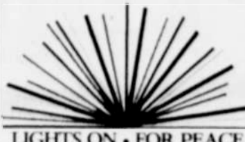
LIGHTS ON • FOR PEACE

The idea of lighting a candle to dispel the darkness is centuries old, says a news release from the Ecumenical ministries of Oregon. The act of lighting a candle is symbolic of the hope for a new beginning. "Lights On For Peace," began in Oregon and is gathering world-wide momentum. The Bishops and Executives of Ecumenical Ministries of Oregon started a call for a symbol of hope during the forthcoming talks in Geneva between President Ronald Reagan and Premier Mikhail Gorbachev. That effort has now spread to the World Council of Churches, National Council of Churches, the United States Catholic Conference, The National Rabbinical associations, Oregon Senator Mark Hatfield and Oregon Representative Les AuCoin who are sponsoring a Resolution that will call for a display of such hope. Governor Atiyeh has issued a proclamation designating