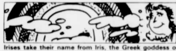
Iris takes their name from Iris, the Greek goddess of the rainbow.

The Morrow County District Attorney's office at the Morrow County Courthouse in Heppner reports handling the following business