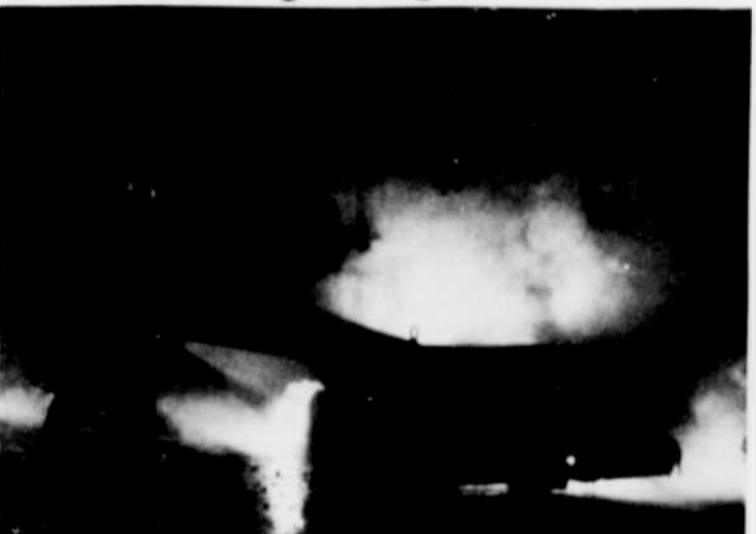
The Heppner Fire Dept. responded to a pickup truck on fire on the Heppner Condon Highway at 5:46 a.m. last Thursday, Oct. 31. The pickup truck belonged to Guy VanArsdale.