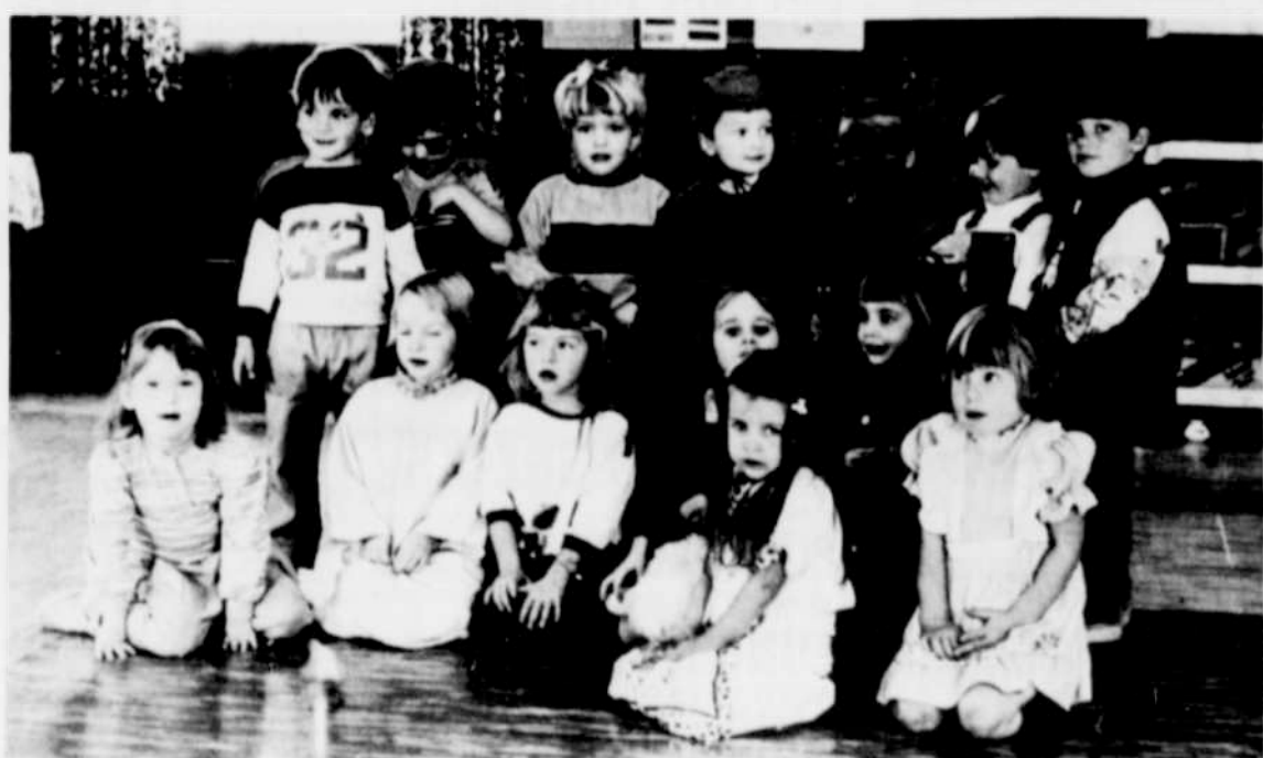
3-year-old pre-school class shows off its Halloween costumes during class last week.