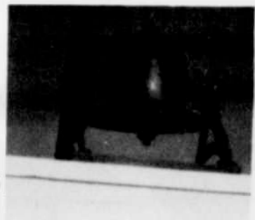
The school bell from the Lexington School District was recently presented to the City of Lexington and has been placed on top of the City Hall by Lexington citizens. The bell is from the Lexington School, which has been closed for about 25 years.