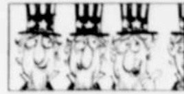
The United States would fit into the continent of Africa three and a half times.