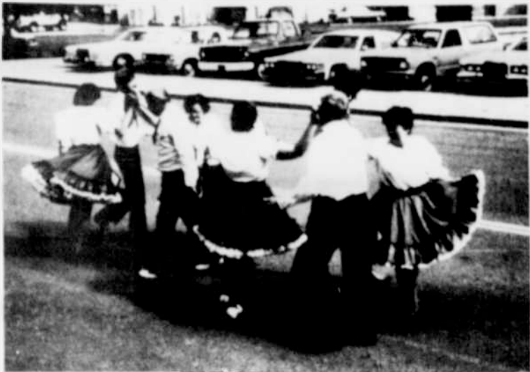
Ione Grand Squares

Ione Grand Squares would like to invite everyone to come learn how to square dance. Grand Squares is a family oriented club that has been in this area dancing and having fun for over 18 years. Now is the chance to join in. We are beginning our lessons on Thursday, Sept. 26 at the Elementary gym in Ione from 7 to 9 p.m. All