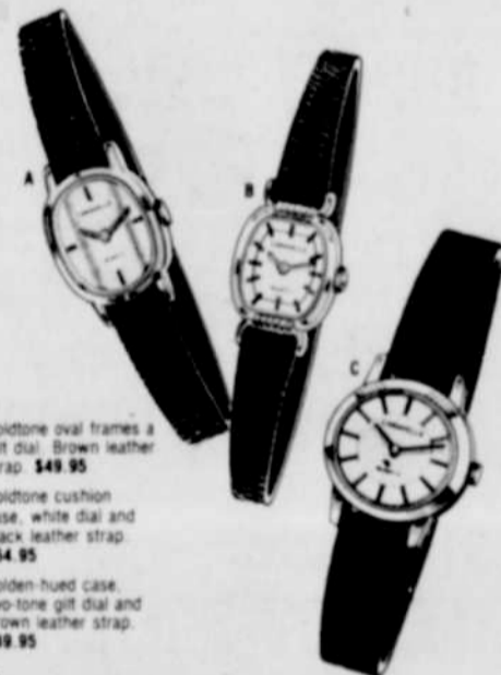
A. Goldtone oval frames a gilt dial. Brown leather strap. $49.95 B. Goldtone cushion case, white dial and black leather strap. $54.95 C. Golden-hued case, two-tone gilt dial and brown leather strap. $49.95