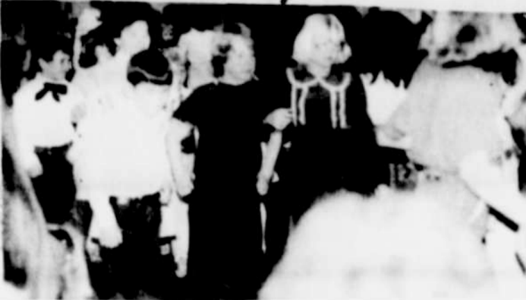
Elementary students perform grand march for parents and guests