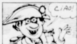
Napoleon had conquered Italy by the time he was twenty-six.