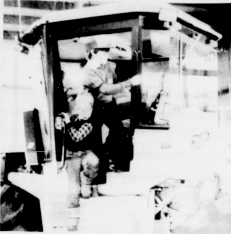
FUTURE TRACTOR DRIVERS? —Kids test out the equipment during M.C.C.G. Customer Appreciation Day held Saturday.