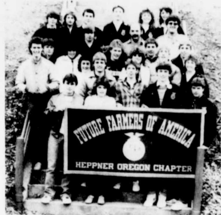
Members of the Heppner Chapter of Future Farmers of America pose with FFA emblem in honor of National FFA Week, February 17-24.