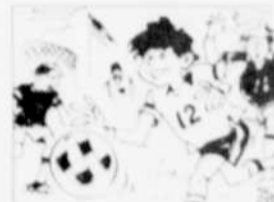
Exercise through sports can be fun for a child, and important in body development.

- Keep up-to-date. Learning how to control and eliminate hazards is a continual educational process for everyone on the farm. The experienced worker should study the safe operating procedures of any new equipment, chemicals, work procedures or other changes. New or inexperienced farm workers should be thoroughly trained. Educational materials and classes are offered through county Extension offices, vocational-agricultural programs, farm organizations, and insurance companies.