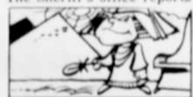
The longest known reign in history was that of Pepi II of the sixth Egyptian dynasty. He became king at the age of six and ruled until he died 94 years later.

The Sheriff's office reports that the investigation is continuing.