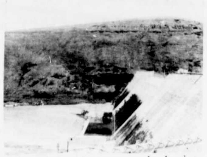
Face of dam with seepage marks showing

A concern to many people has been the leakage of water through the walls of the dam. Although leakage can still be seen by the wet damp face of the dam and in the gallery (a tunnel which runs through the dam) the recently completed $2 million grouting project has reduced that leakage by 90 percent. The leakage will continue to decrease through the years, says Bessey, as minerals in the water cause a natural solidification of the dam wall.