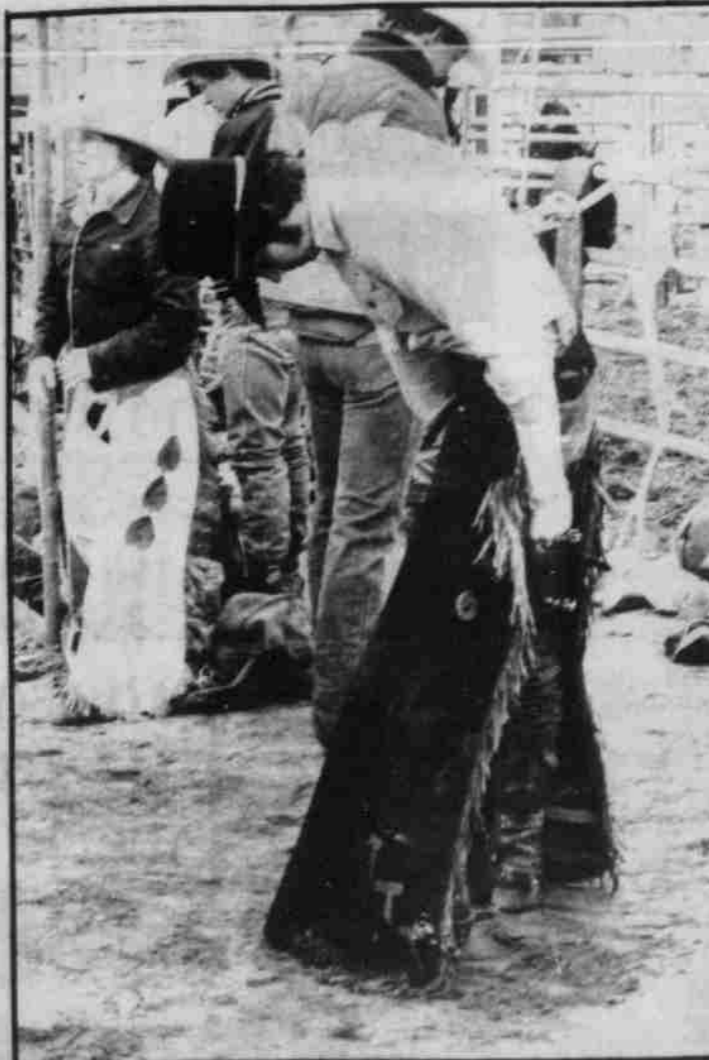
The cowboys express their individuality often through the medium of their chaps.