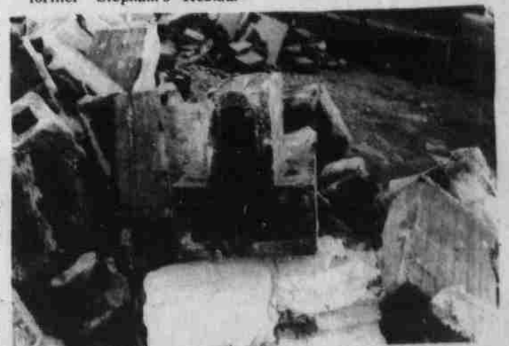
One of the bricks salvaged from the old buildings.