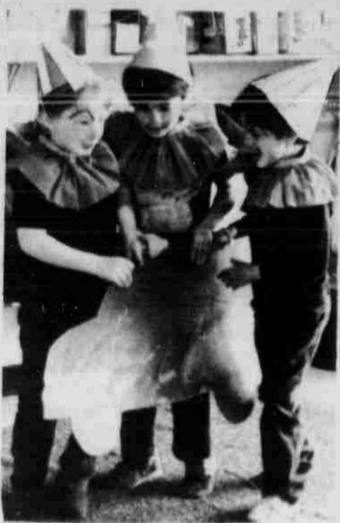
A full circus, complete with clowns, trapeze artists, and lovely ballerinas performed for family and friends last Friday in Cherry Webber's kindergarten class at Heppner Elementary.