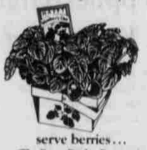
serve berries... (The Berry Basket Bouquet)