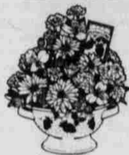
drain fruit... (The Colander Bouquet)