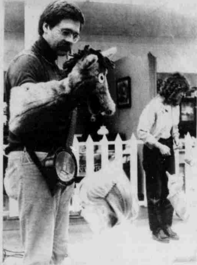
schedule performing at the Boardman City Library and