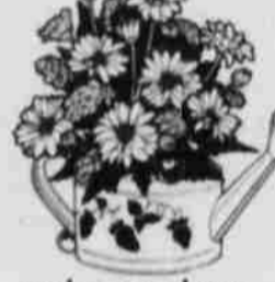
and water plants... (The Watering Can Bouquet)