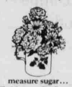
measure sugar... (The Measuring Cup Bouquet)