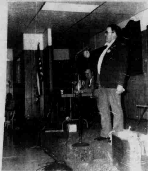
Estimates of the number of people who turned out for Heppner's St. Patrick's Day celebration Saturday ranged from 1,200 up, but by any standard of measurement, the feeling about town was that it turned into a resounding success.