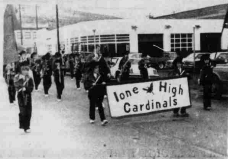
Organizers of the event were praised at the Heppner-Morrow Chamber of Commerce luncheon Tuesday for their work in putting together the now annual event which has grown from a small get-together in 1982, to a town-wide celebration in 1984.