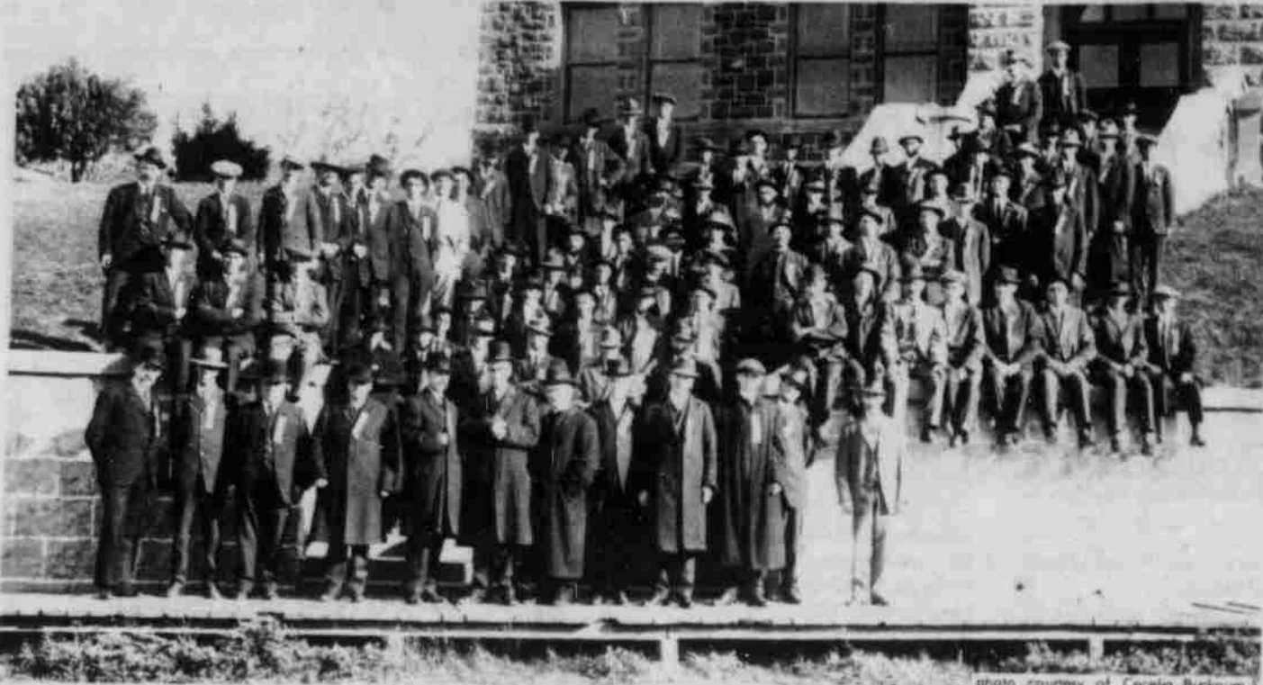
This picture of the Heppner Hibernia Society was taken in 1914. The local group, made up of Irish Americans, was one of the first such societies formed in Oregon. The descendants of the men in this picture are invited to

meet in front of the Morrow County Courthouse on the steps for a group photo at 2:30 p.m. on St. Patrick's Day, Saturday, Mar. 17.