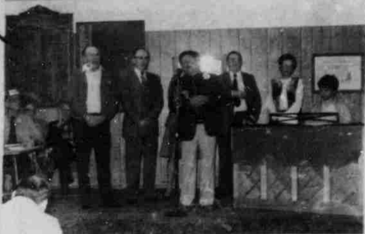
March 17, 1983 KUMA broadcast from the Heppner Elks Lodge

Local Irish tenors will sing Irish songs, and other interesting and fun features are planned.