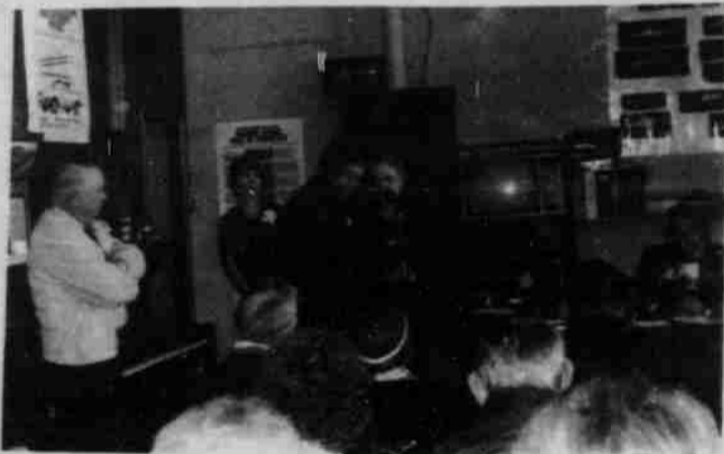
KUMA radio broadcast live from Farley Motor Co. showroom March 17, 1982

KUMA radio station of Pendleton will again be broadcasting its "Koffee Hour" live from the Heppner Elks Lodge this Saturday as part of the town's St. Patrick's Day Celebration. The show will air from 10 to 11:30 a.m., upstairs in the lodge building.