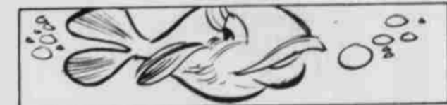
There are 100 fancy varieties of goldfish.

Total fouls: Heppner 21, Wasco 20. Fouled out: Orr, Boggs.