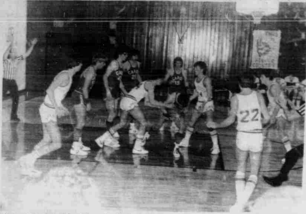
Unidentified Cardinal is tied up by Honker