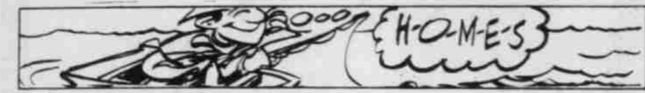
The names of the five Great Lakes can be remembered through the use of the mnemonic device: H-O-M-E-S. Huron, Ontario, Michigan, Erie and Superior.