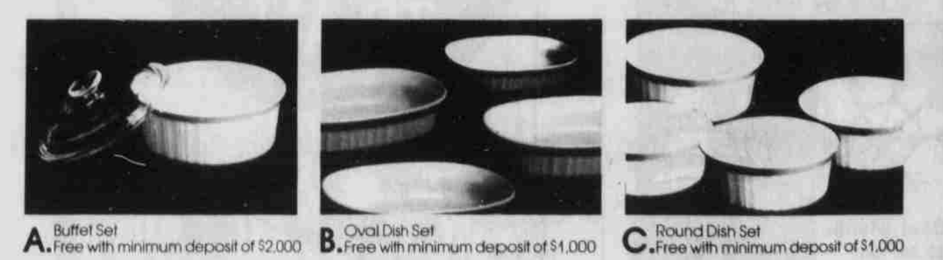
A. Buffet Set Free with minimum deposit of $2,000. B. Oval Dish Set Free with minimum deposit of $1,000. C. Round Dish Set Free with minimum deposit of $1,000.

As a special offer, for anyone opening or adding to an IRA, KEOGH-CORPORATE or SEPP retirement fund, we have these outstanding gifts. All are Corning Ware freezer to oven cookery in the current French White style. One gift per customer, please. Offer good while supply lasts.