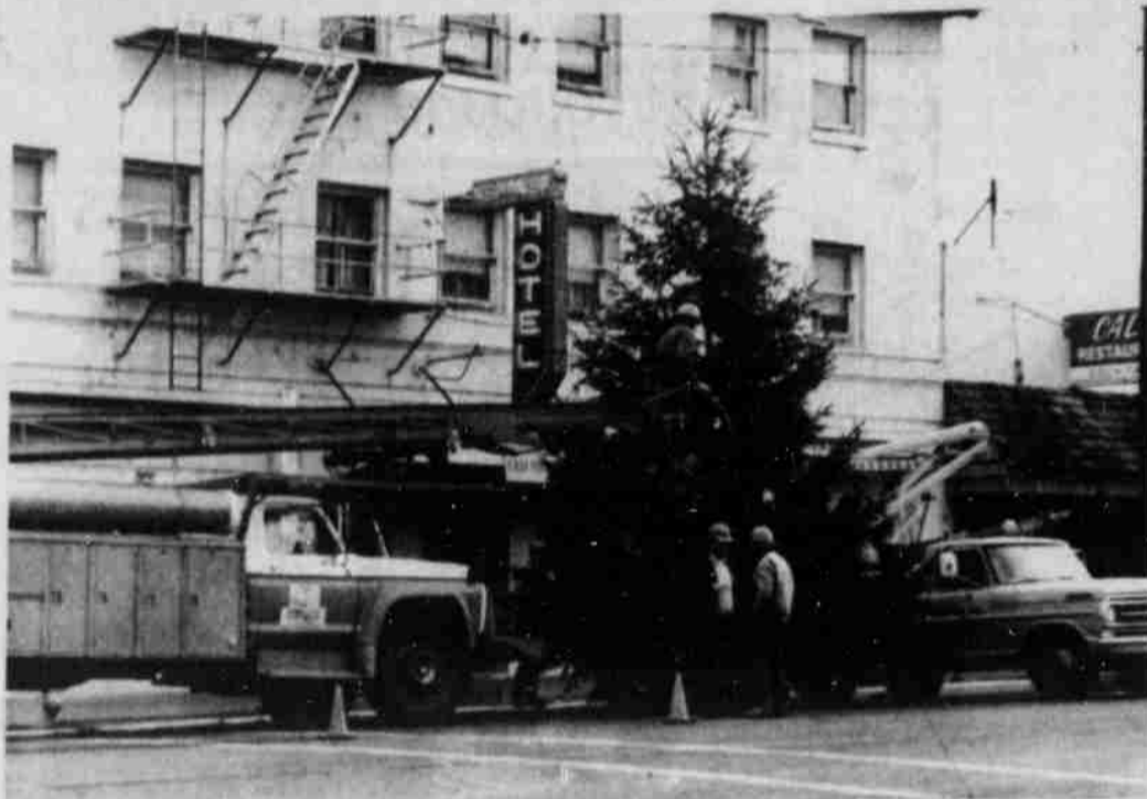
Crews worked earlier this week to put up hanging decorations and decorated the city's Christmas tree.

"Christmas at Home" will kickoff this Friday as many local merchants will begin giving "Real Money Coupons" to shoppers, and a Christmas Tree Lighting Ceremony will be held that evening. On Saturday, the jolly couple from the North Pole will be making their annual visit. The Real Money Coupons,