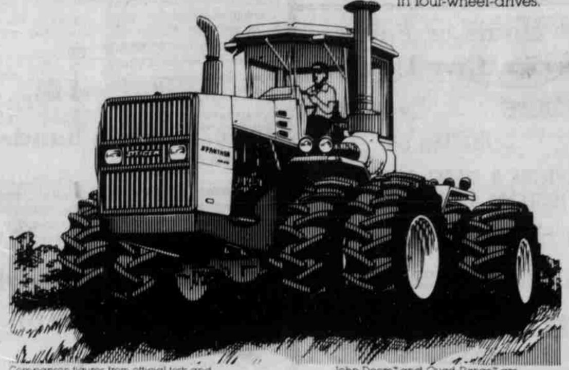
Comparison figures from official tests and manufacturer's published data.

Because all arguments aside, when you look at performance and specs, it's evident why Steiger is the best value in four-wheel-drives.