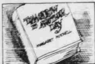
The original title of Gone with the Wind was Tomorrow is Another Day .

The Condon Blue Devils come to Ione on Thursday, Oct. 27, for a 1:30 p.m. match with Ione.