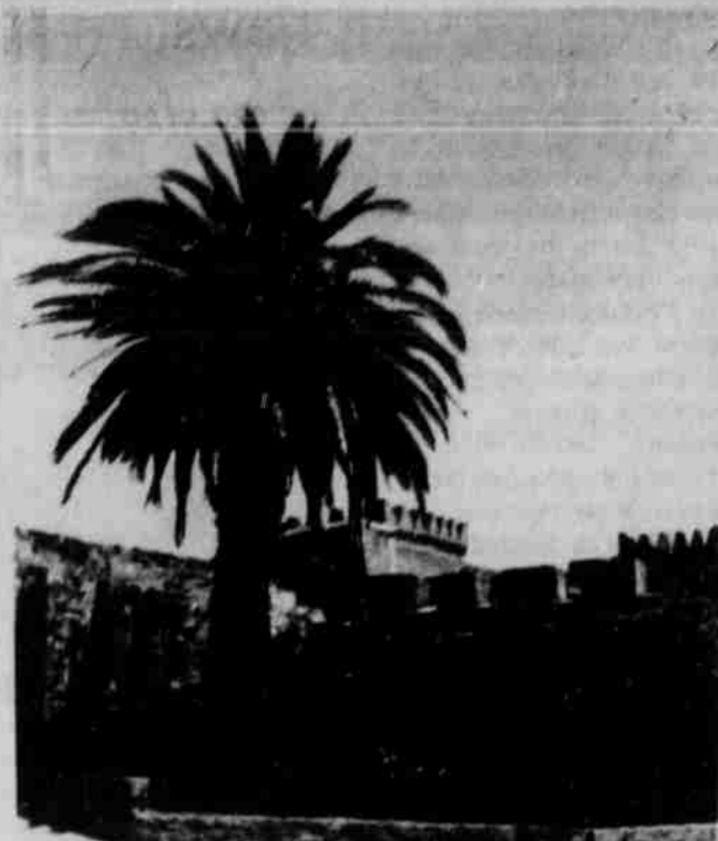
The Alcazar (fortress) in Tangier

Leisurely after-dinner walks and meeting new people became activities treasured by many of us. Further adventures will be featured next week.