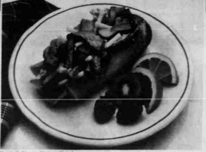
Steak & Swiss Cheese Salad