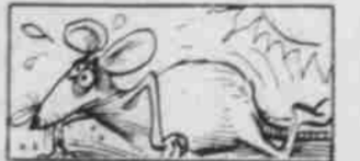
A rat can go longer without water than a camel can.

Through offerings, 108 chicks were purchased for Heifer Project International. In the Heifer Project, groups such as I.U.C.C. purchase farm animals for the project, and the animals are sent to a needy village or family. A member of the effort accompanies the animals to show the new owners how to care for them. Then, to keep the project going, the animals' first born is given back to the project and will be given to another family.