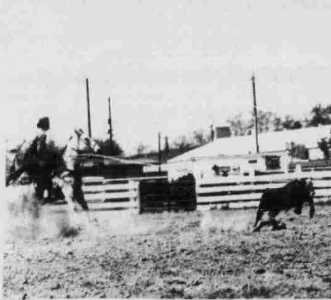
Pat Schwarz takes first place in calf roping at Hermiston.